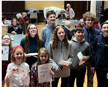
Valentine's Day COA Tea Party