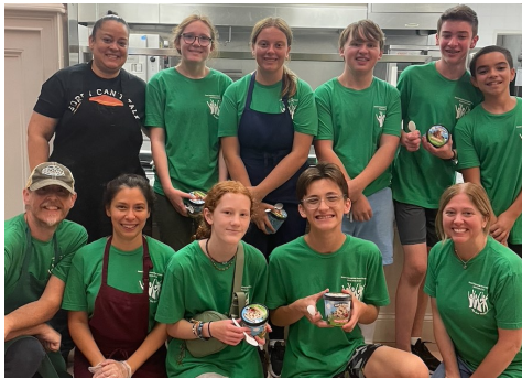
Cor Unum Soup Kitchen- Mission Trip