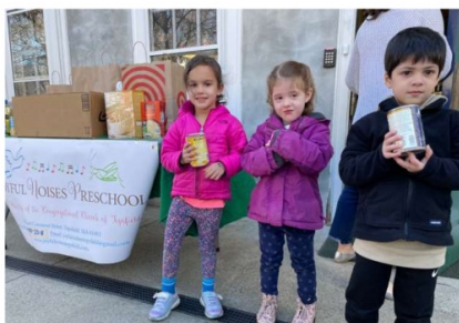
Joyful Noises Preschool joins CCOT in giving food donations to Citizens Inn

Thanks to all who donated food for Citizens Inn! We filled up their truck with food on Monday, thanks to our members' generosity along with contributions from Joyful Noises Preschool.